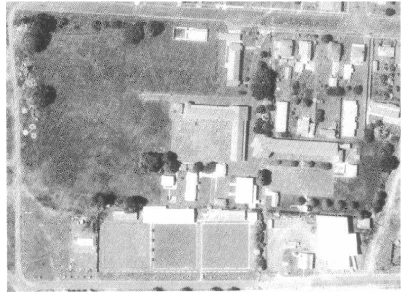
The local Council can provide an aerial photograph of the school.